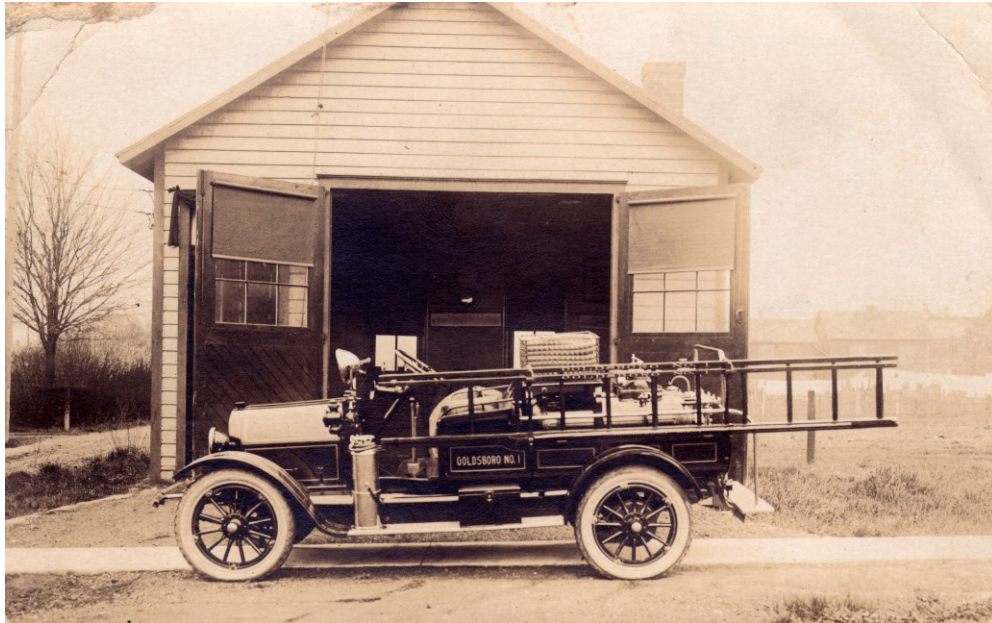
Goldsboro Fire Company's original engine house and their 1917 Martin chemical truck.